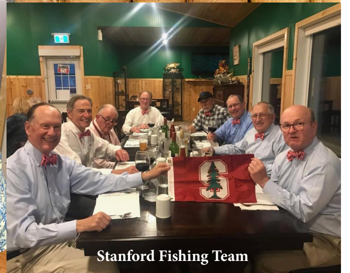
Stanford Fishing Team