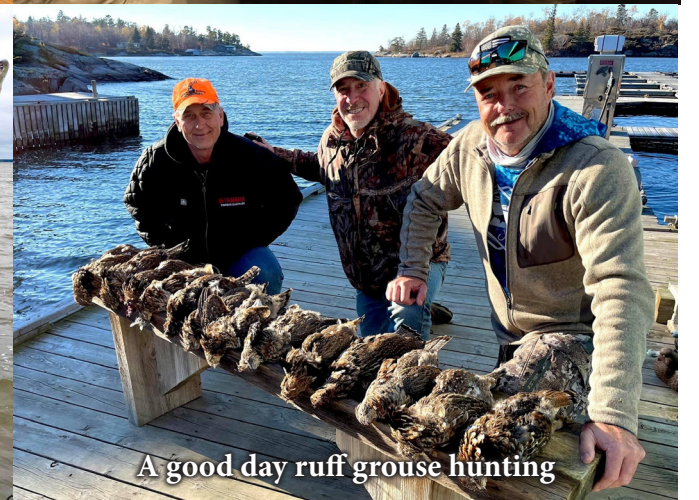
A good day ruff grouse hunting